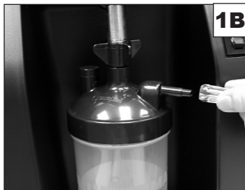
1B. Oxygen Tubing Connection With Humidification: Fill humidifier bottle, thread humidifier bottle wing nut onto oxygen outlet and tighten securely. Attach tubing to humidifier bottle outlet fitting.

2. With power switch OFF, firmly attach cord to unit and plug into wall outlet.