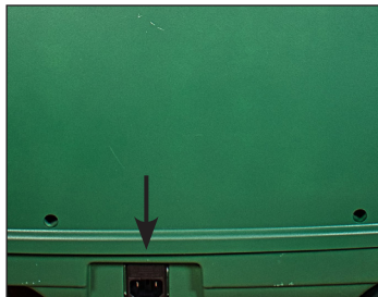
Ensure power cord is fully inserted into concentrator IEC connector.

2. With power switch OFF, firmly attach cord to unit and plug into wall outlet.