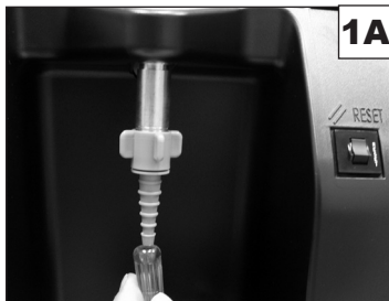
1A. Oxygen Tubing Connection: Thread oxygen outlet connector onto oxygen outlet and attach tubing to the connector.

1A OR 1B. Attach the appropriate oxygen accessories to the oxygen outlet. If cannula isn't attached to oxygen tubing, follow manufacturer's instructions to attach.