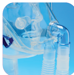
Configuration for dual limb ventilator