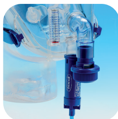
Configuration for CPAP with "Easy Vent" Venturi Generator