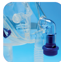
Configuration for single limb ventilator or CPAP Generator