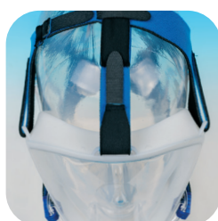
The fifth attachment point allows a better seal on patients' forehead