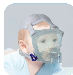
DiMax Zero XS/Pediatric